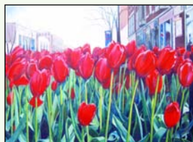
Flint Artists Market